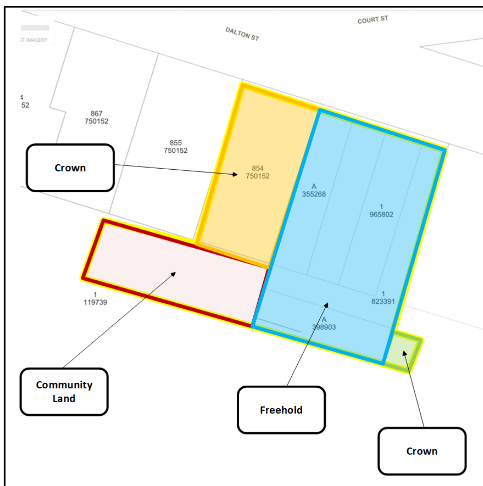
Image: Total of land parcels encompassing the Parkes Early Childhood Centre.

Council negotiations have progressed with the Parkes Early Childhood Centre (PECC), regarding the possible ownership transfer of the PECC building from Council to the management body. The PECC is situated in Dalton Street, it is built over a number of land parcels and those land parcels have a number of different ownership arrangements (see figure below).