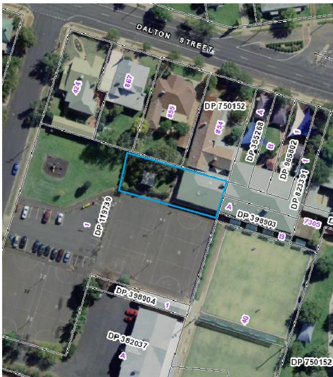
Image: Lot 1 DP 119739 is Community land and is subject to this Planning Proposal. Highlighted blue area indicative area to be acquired by the PECC.

PECC and Council have agreed on general terms as follows: